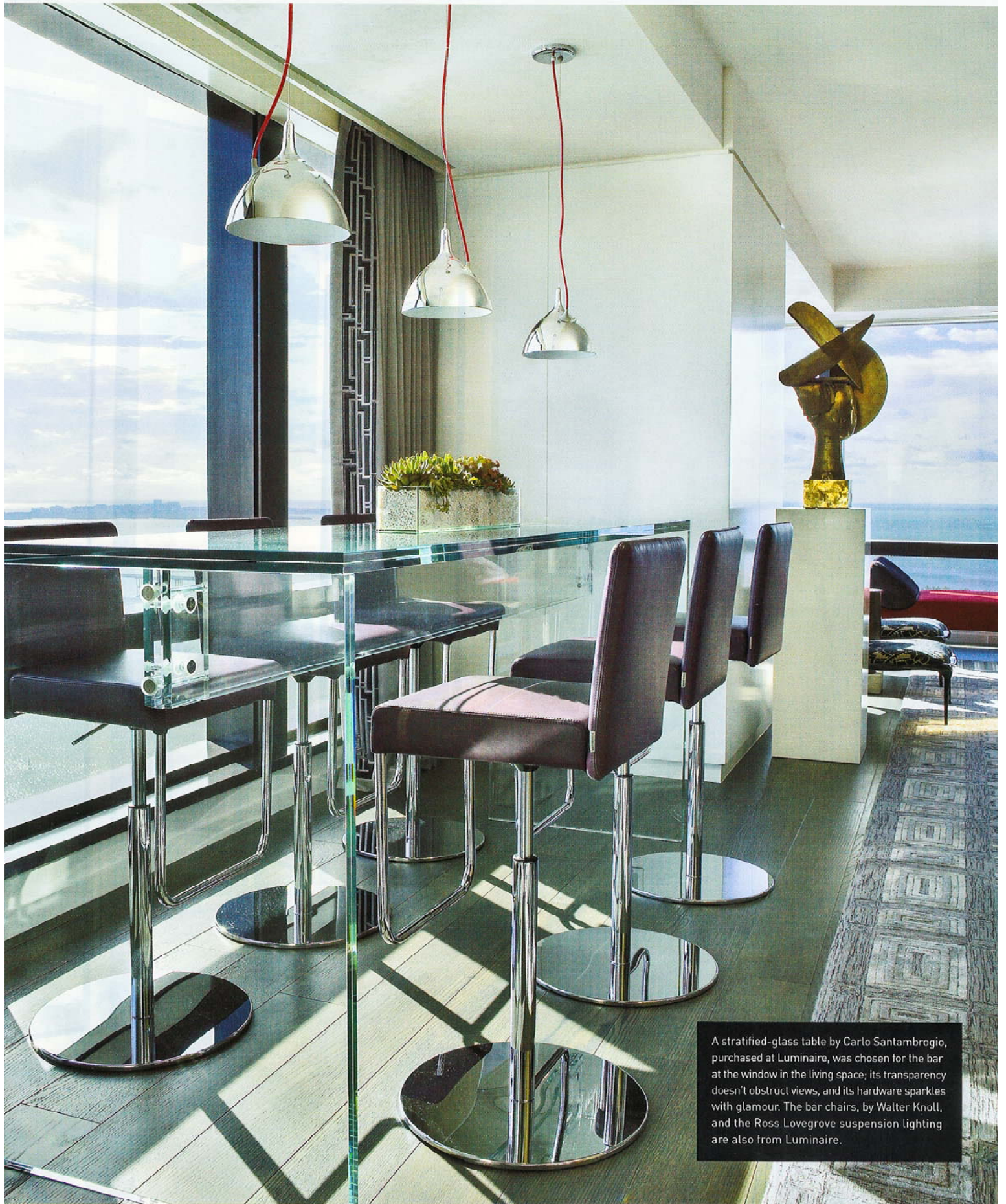
A stratified-glass table by Carlo Santambrogio, purchased at Luminaire, was chosen for the bar at the window in the living space; its transparency doesn't obstruct views, and its hardware sparkles with glamour. The bar chairs, by Walter Knoll, and the Ross Lovegrove suspension lighting are also from Luminaire.