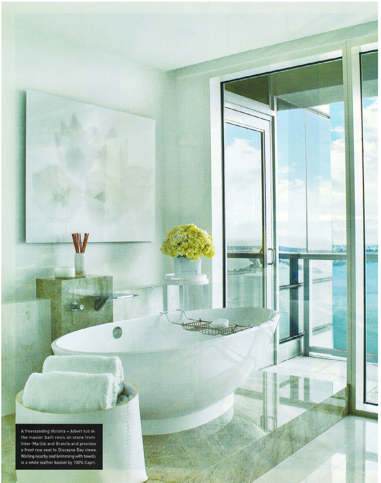
A freestanding Victoria + Albert tub in the master bath rests on stone from Inter-Marble and Granite and provides a front row seat to Biscayne Bay views. Waiting nearby and brimming with towels is a white leather basket by 100% Capri.