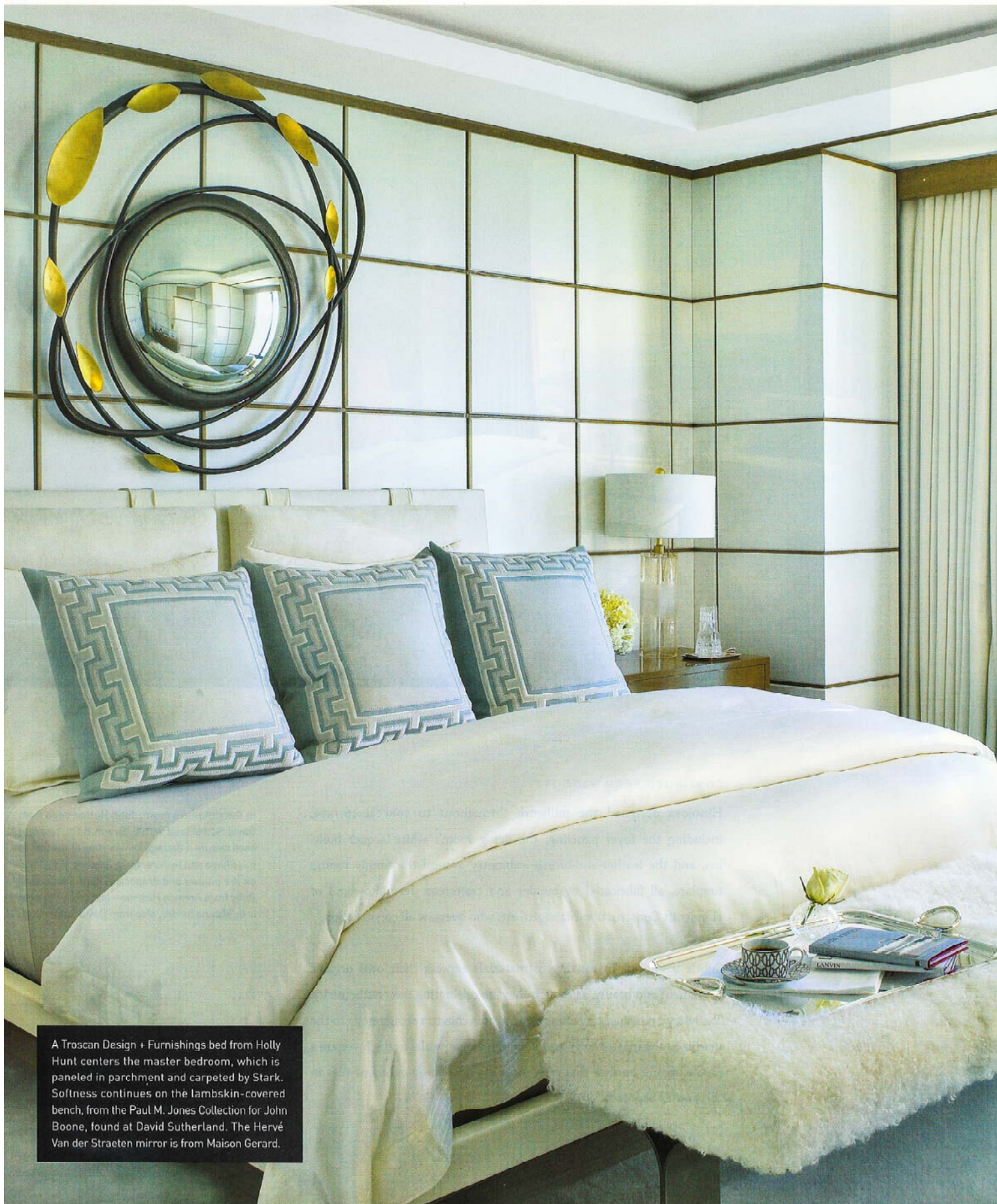
A Troscan Design + Furnishings bed from Holly Hunt centers the master bedroom, which is paneled in parchment and carpeted by Stark. Softness continues on the lambskin-covered bench, from the Paul M. Jones Collection for John Boone, found at David Sutherland. The Hervé Van der Straeten mirror is from Maison Gerard.