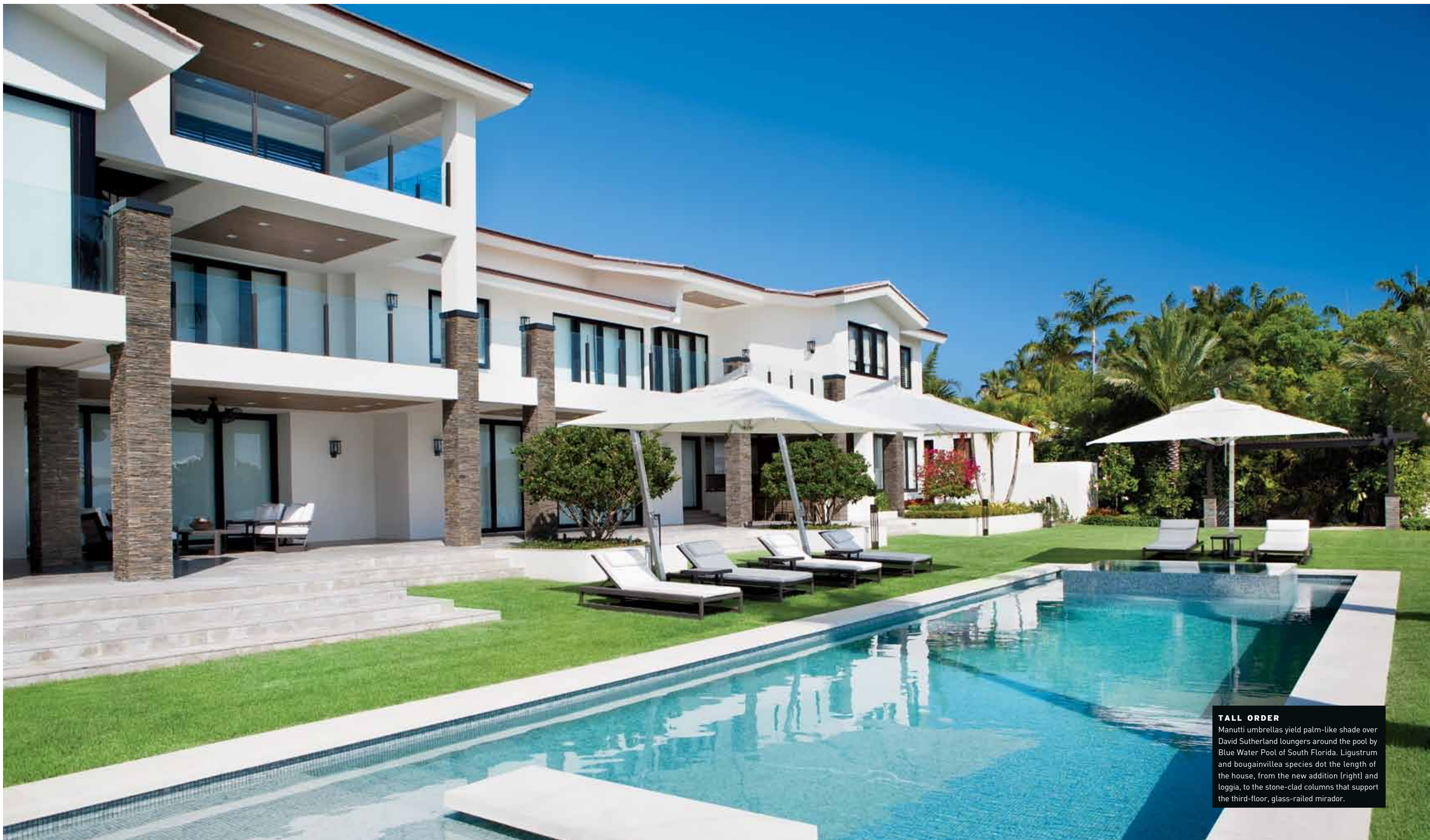
TALL ORDER Manutti umbrellas yield palm-like shade over David Sutherland loungers around the pool by Blue Water Pool of South Florida. Ligustrum and bougainvillea species dot the length of the house, from the new addition (right) and loggia, to the stone-clad columns that support the third-floor, glass-railed mirador.