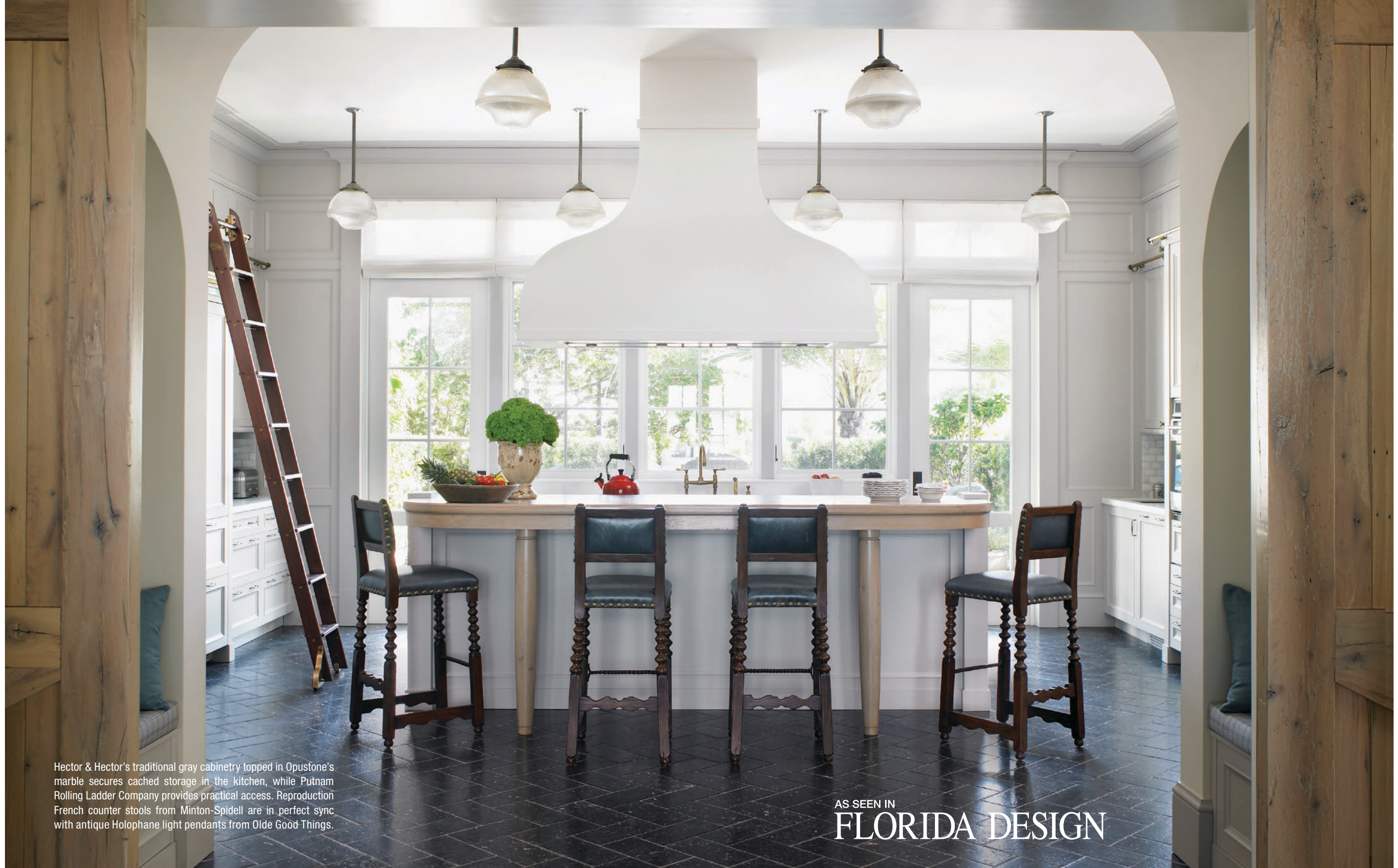
Hector & Hector's traditional gray cabinetry topped in Opustone's marble secures cached storage in the kitchen, while Putnam Rolling Ladder Company provides practical access. Reproduction French counter stools from Minton-Spidell are in perfect sync with antique Holophane light pendants from Olde Good Things.