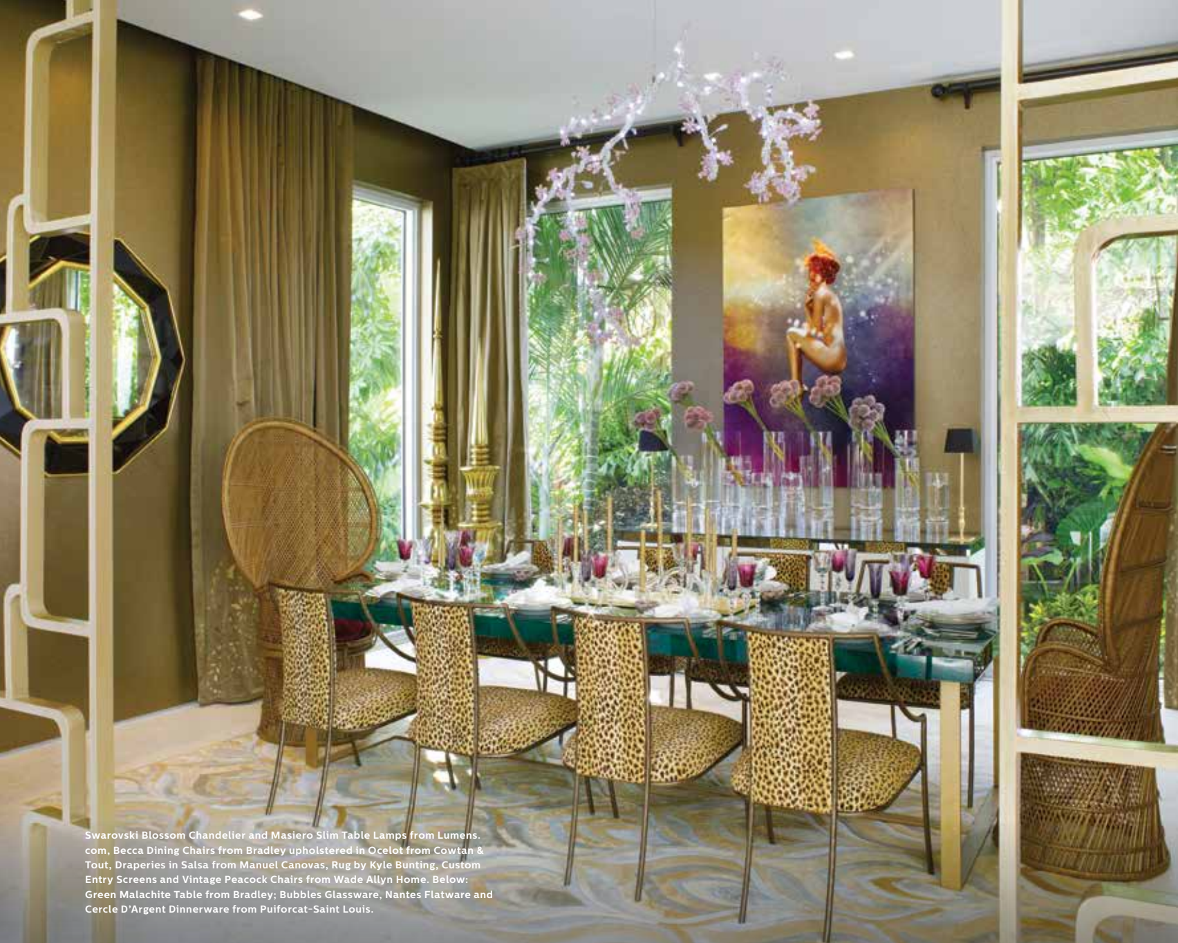
Swarovski Blossom Chandelier and Masiero Slim Table Lamps from Lumens.com, Becca Dining Chairs from Bradley upholstered in Ocelot from Cowtan & Tout, Draperies in Salsa from Manuel Canovas, Rug by Kyle Bunting, Custom Entry Screens and Vintage Peacock Chairs from Wade Allyn Home. Below: Green Malachite Table from Bradley; Bubbles Glassware, Nantes Flatware and Cercle D'Argent Dinnerware from Puiforcat-Saint Louis.