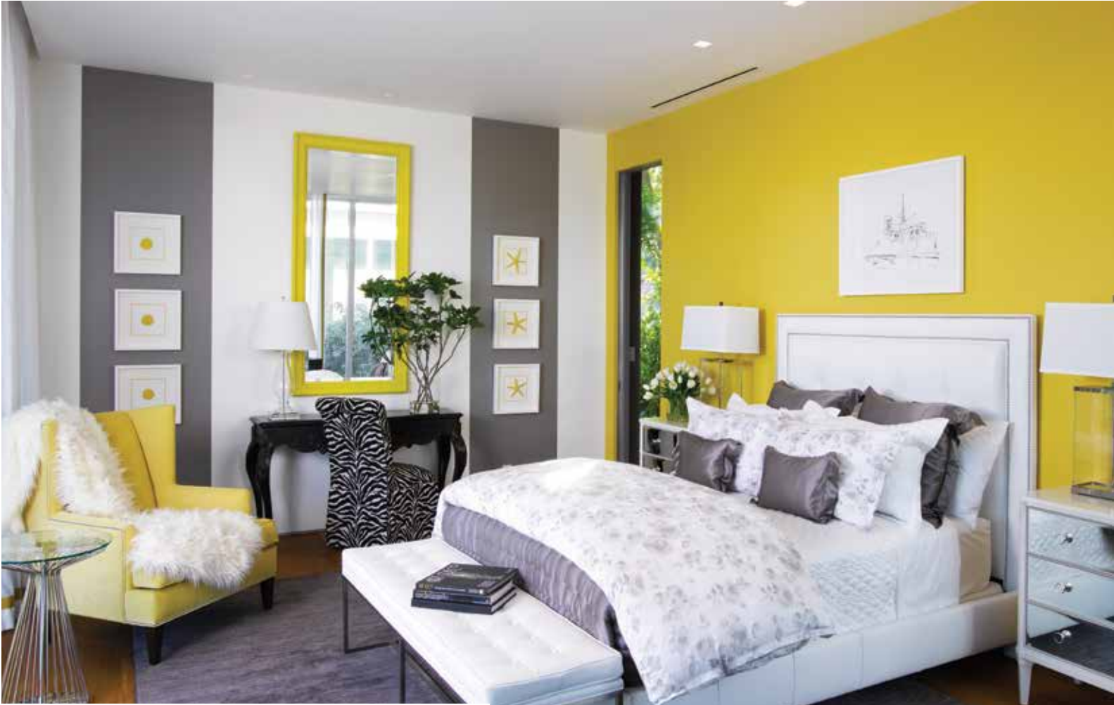
Loomed Wool Rug in Charcoal, Radial Table, Olivia Dining Chair, Parker Chair, Veronica Mirrored Chest, Jensen Queen Headboard, Mateo Leather Bench, Groton Glass Table Lamp and artwork from Ethan Allen; Wall painted in Farrow & Ball Charleston Gray No. 243 and Babouche No. 223. Left: Biscayne Side Table and Biscayne Dining Armchair from Ethan Allen.