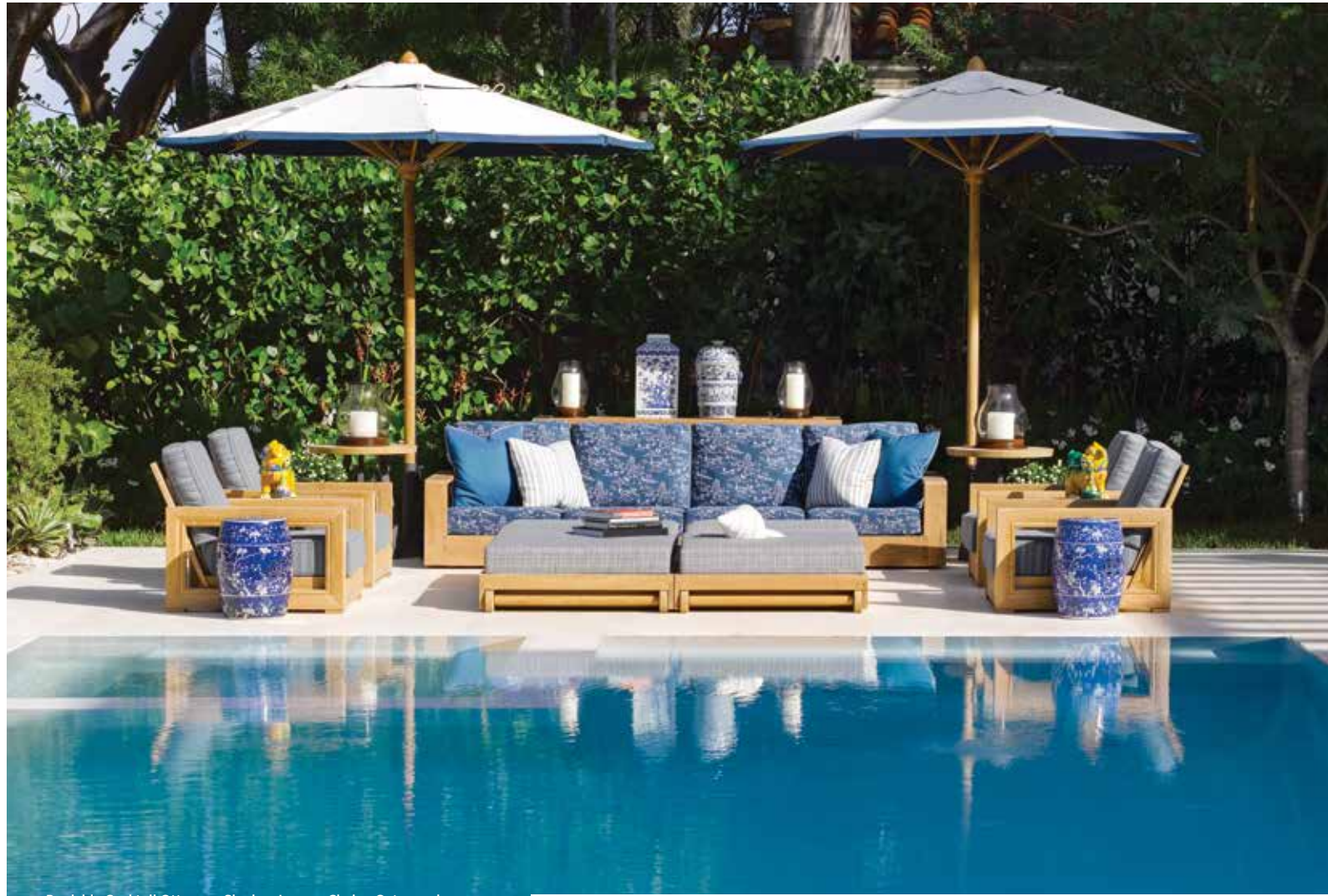
Poolside Cocktail Ottoman, Shadow Lounge Chairs, Octagonal Umbrellas, Peninsula Console and Ralph Side Tables from Sutherland; The Beach Outdoor Floor Lamp by Lights Up! from Lumens.com. Right: Nomad Seating units and Ottomans in Urban stripe and Nomad White Tables by Gloster. Far Right: John Hutton Shadow Banquet Chairs, Peninsula Dining Table and Aziyade Lounge Chairs from Sutherland.