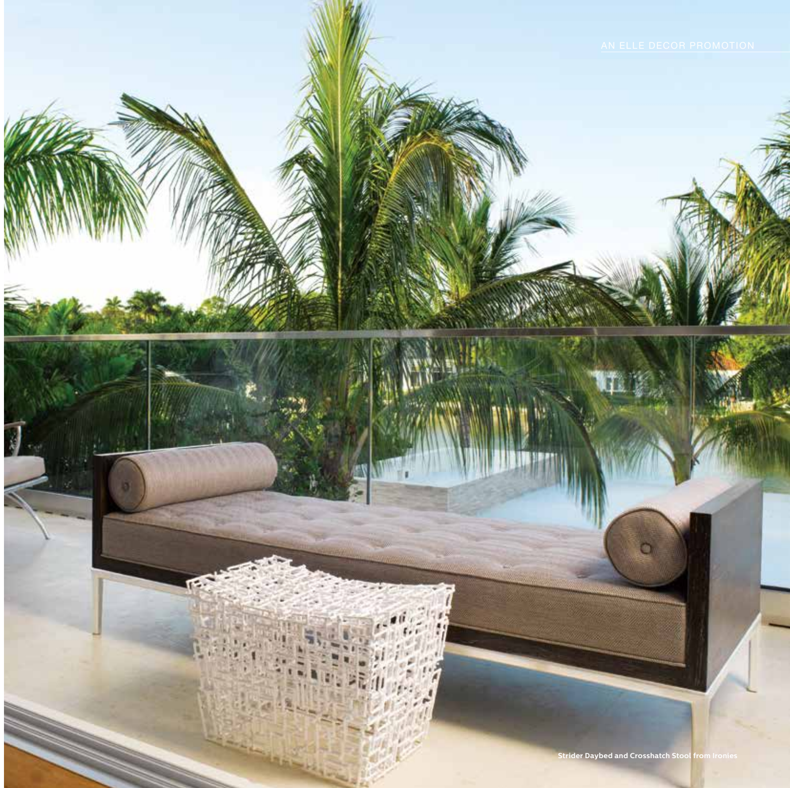
Strider Daybed and Crosshatch Stool from Ironies