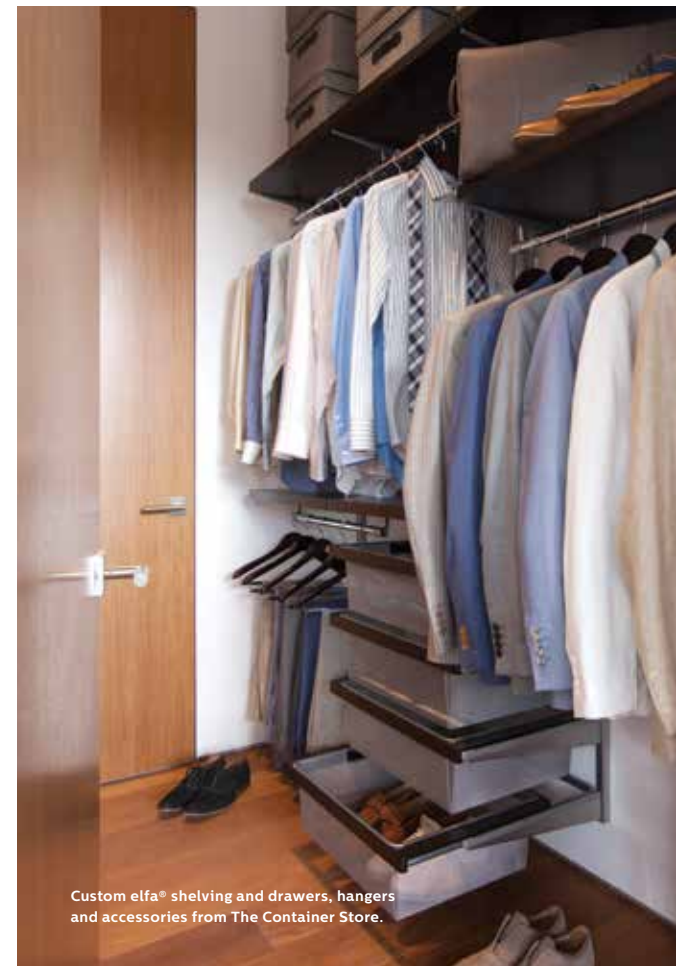
Custom elfa® shelving and drawers, hangers and accessories from The Container Store.