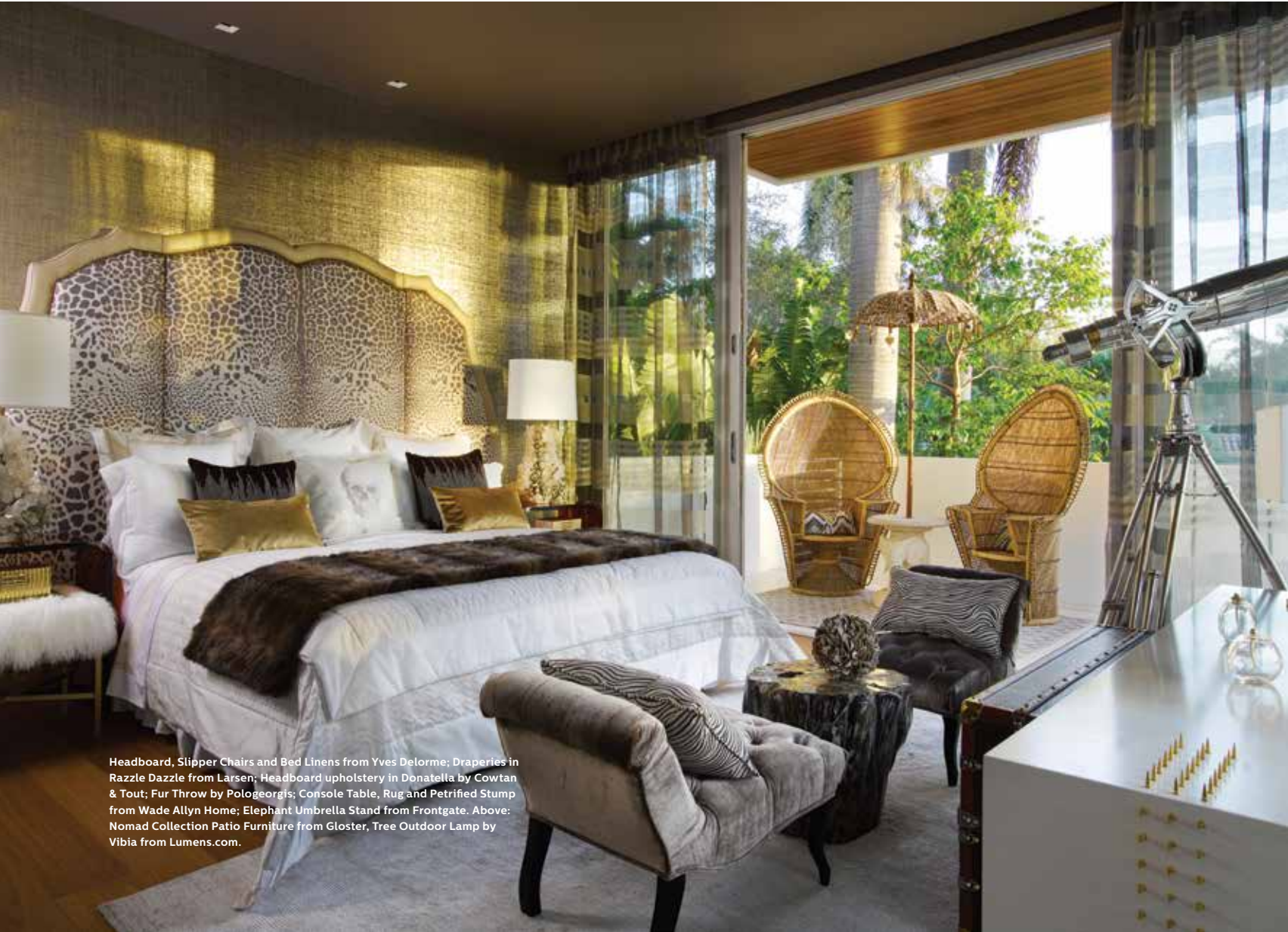
Headboard, Slipper Chairs and Bed Linens from Yves Delorme; Draperies in Razzle Dazzle from Larsen; Headboard upholstery in Donatella by Cowtan & Tout; Fur Throw by Pologeorgis; Console Table, Rug and Petrified Stump from Wade Allyn Home; Elephant Umbrella Stand from Frontgate. Above: Nomad Collection Patio Furniture from Gloster, Tree Outdoor Lamp by Vibia from Lumens.com.