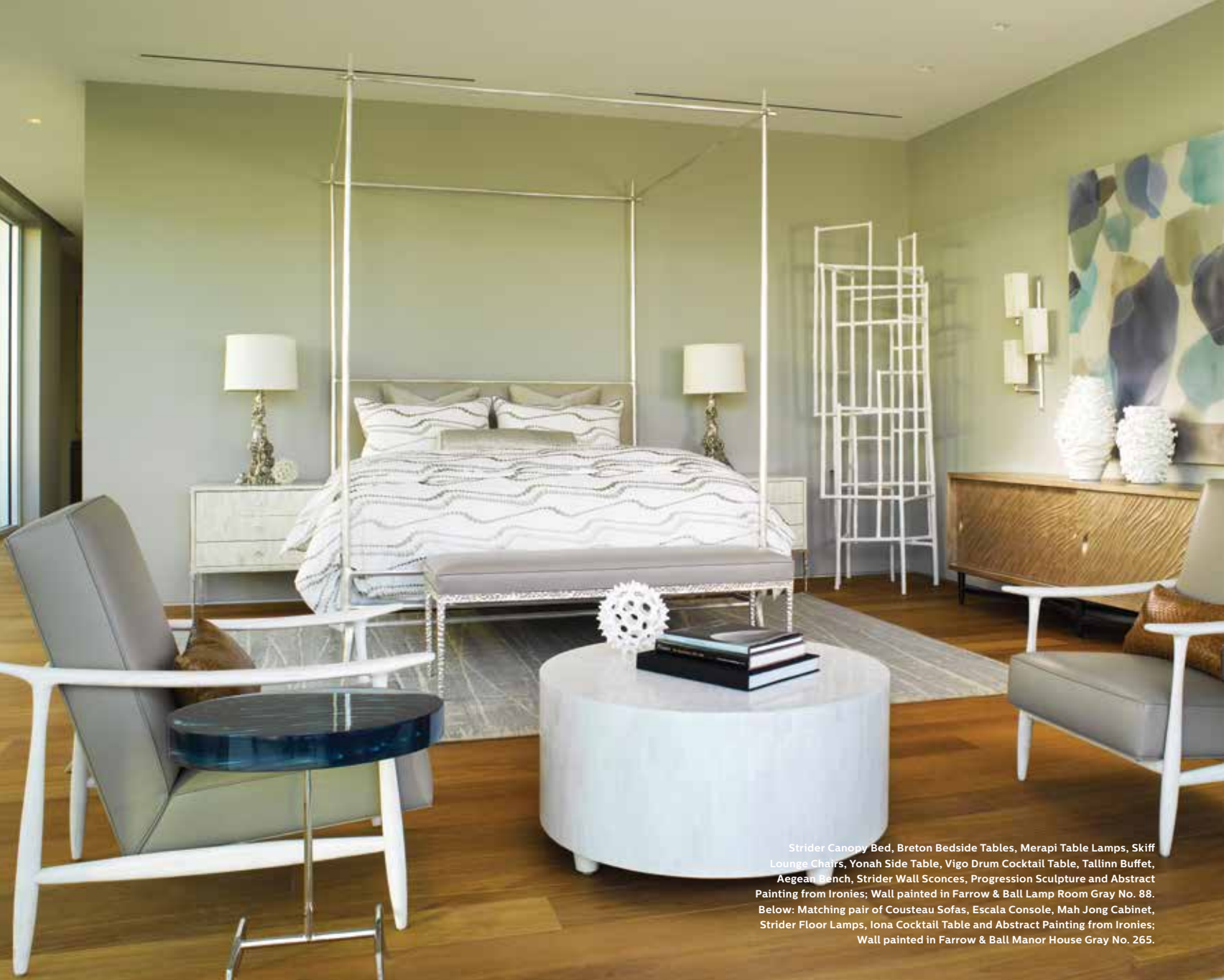
Strider Canopy Bed, Breton Bedside Tables, Merapi Table Lamps, Skiff Lounge Chairs, Yonah Side Table, Vigo Drum Cocktail Table, Tallinn Buffet, Aegean Bench, Strider Wall Sconces, Progression Sculpture and Abstract Painting from Ironies; Wall painted in Farrow & Ball Lamp Room Gray No. 88. Below: Matching pair of Cousteau Sofas, Escala Console, Mah Jong Cabinet, Strider Floor Lamps, Iona Cocktail Table and Abstract Painting from Ironies; Wall painted in Farrow & Ball Manor House Gray No. 265.