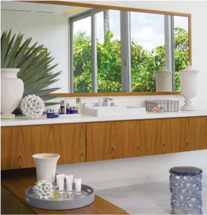
Right: Soirée Free-Standing Tub, Legato Ceiling Mount Shower Head, Upton Collection Shower Valves and Kiwami Renesse Lavatory Sets from Toto; Men's Shaving Kit by Acqua di Parma; Stool and Side Table by Ironies; Pillow Upholstery in Bahamas by Manuel Canovas. Top: Marais Wall-Hung Toilet from Toto, Wall painted in Farrow & Ball London Clay No. 244. Bottom: Skincare and Beauty Products from La Prairie.