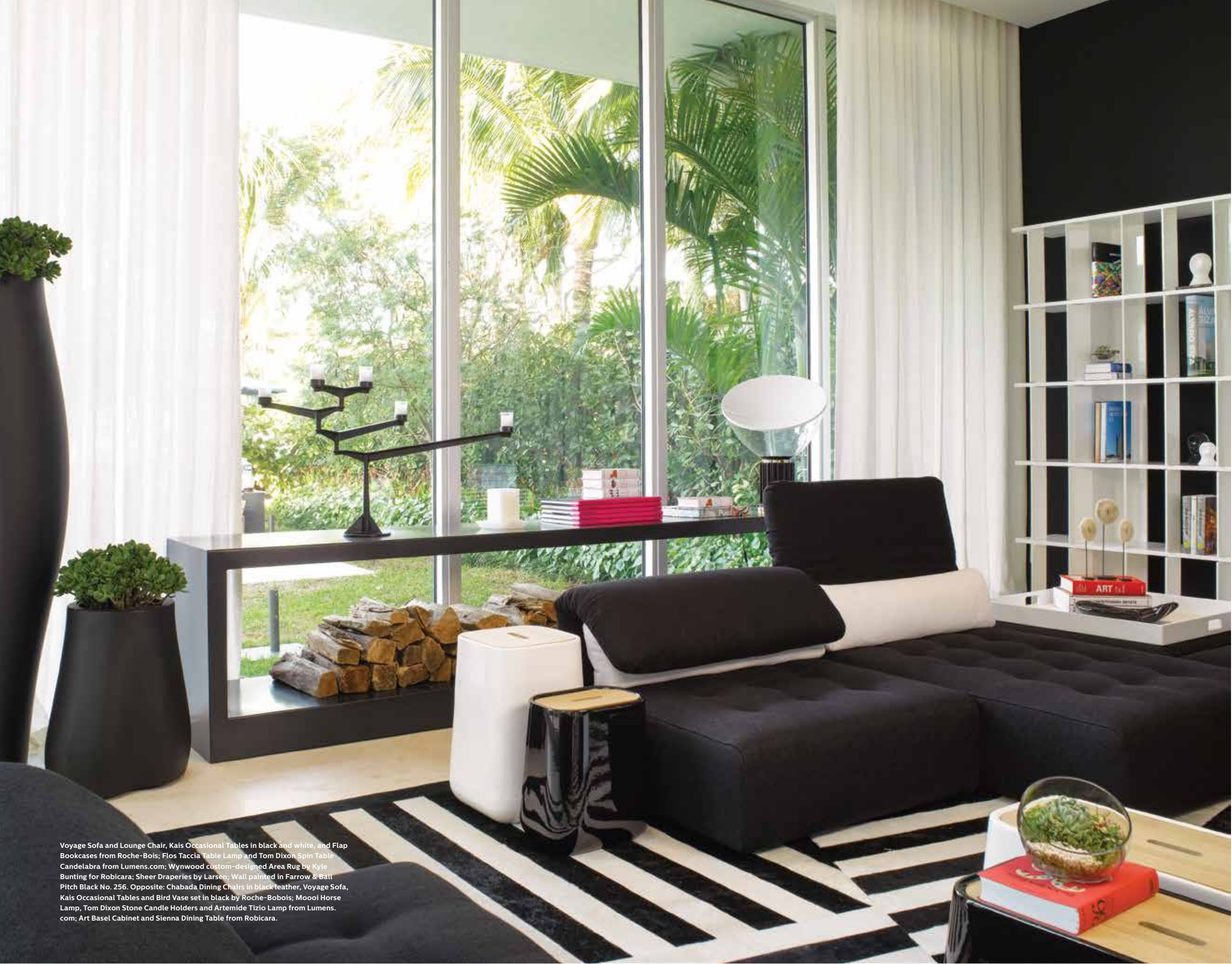
Voyage Sofa and Lounge Chair, Kais Occasional Tables in black and white, and Flap Bookcases from Roche-Bois; Flos Taccia Table Lamp and Tom Dixon Spin Table Candelabra from Lumens.com; Wynwood custom-designed Area Rug by Kyle Bunting for Robicara; Sheer Draperies by Larsen; Wall painted in Farrow & Ball Pitch Black No. 256. Opposite: Chabada Dining Chairs in black leather, Voyage Sofa, Kais Occasional Tables and Bird Vase set in black by Roche-Boboïs; Moooi Horse Lamp, Tom Dixon Stone Candle Holders and Artemide Tizio Lamp from Lumens.com; Art Basel Cabinet and Sienna Dining Table from Robicara.