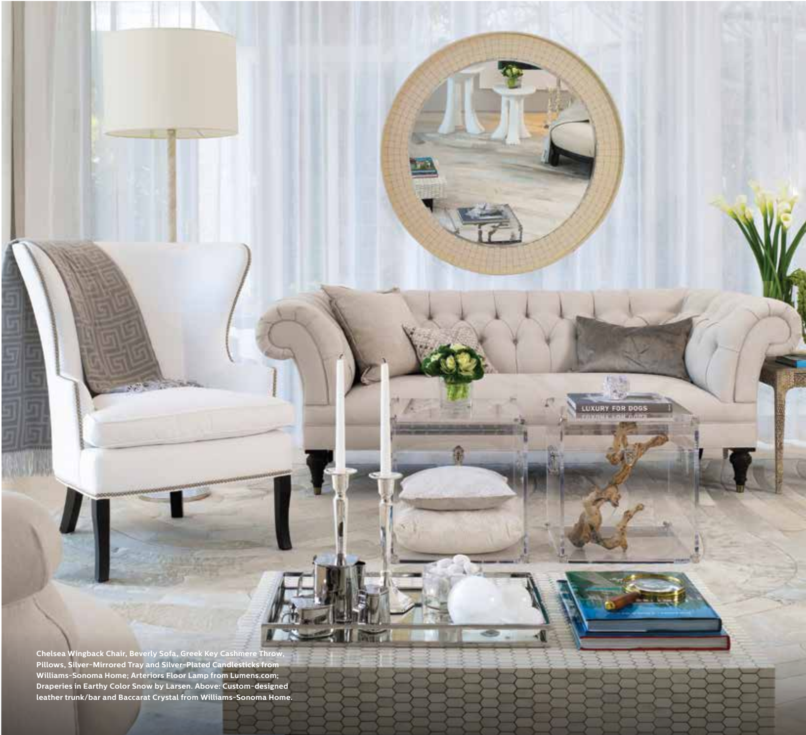
Chelsea Wingback Chair, Beverly Sofa, Greek Key Cashmere Throw, Pillows, Silver-Mirrored Tray and Silver-Plated Candlesticks from Williams-Sonoma Home; Arteriors Floor Lamp from Lumens.com; Draperies in Earthy Color Snow by Larsen. Above: Custom-designed leather trunk/bar and Baccarat Crystal from Williams-Sonoma Home.